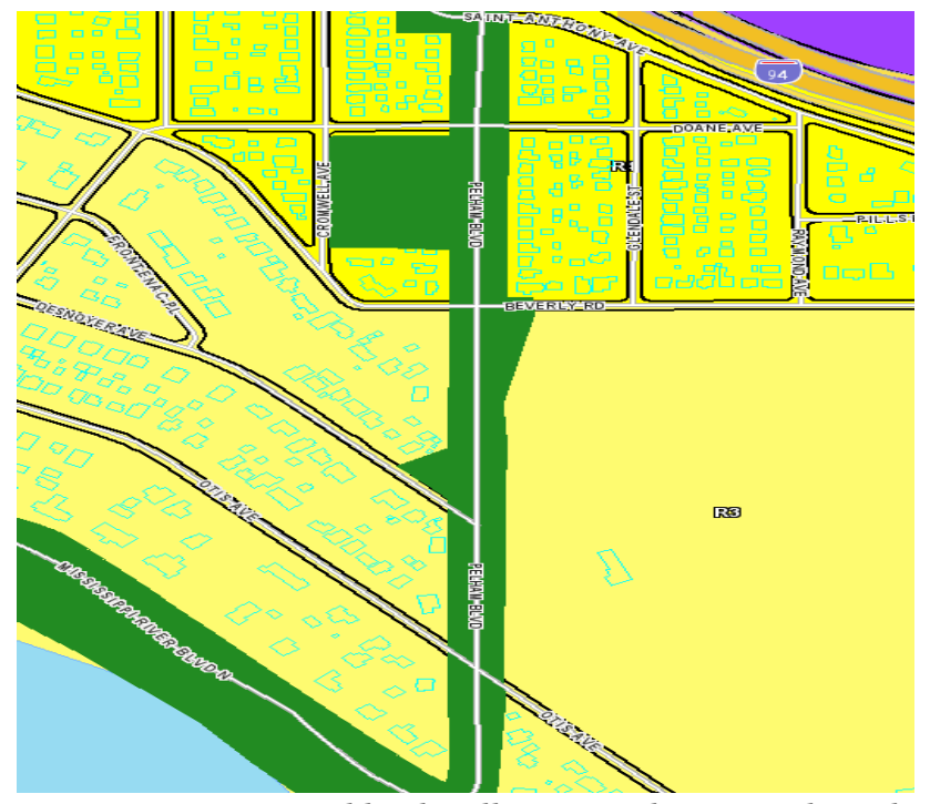
Illustration 1: Zoning/Land Use in Desnoyer Park